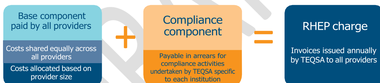
Figure 1: An illustration of the composition of the registered higher education provider (RHEP) charge