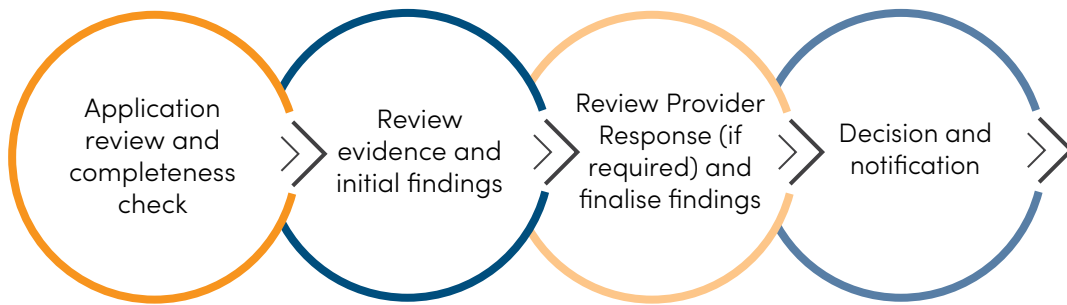
Figure 1. Adding a location to CRICOS registration

The main regulatory effort associated with assessing applications to add a location is the staff effort involved in reviewing the evidence and preparing a report detailing TEQSA's findings and recommending a decision.