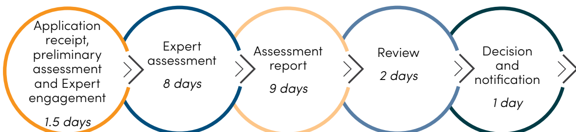
Figure 2: Course accreditation – substantive – first course

Figure 2 below identifies the major processes involved in the substantive assessment of an application for course accreditation.